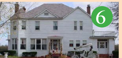
Gems of the Adirondacks See the fall beauty of Northern New York - early September, 2018